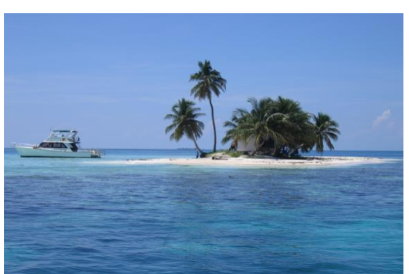
South Silk Caye

Key finding: The natural and cultural resources of southern Belize are considered the most valuable tourism assets of the region.