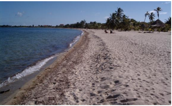
The beach fronting Placencia

In early August, for example, the Placencia Chapter of the BTIA released findings of a survey on tourism development issues conducted with its members. The purpose of the survey was to acquire feedback that enabled the association to take a position on a variety of development topics and issues versus reacting to every individual project proposed on the peninsula. Of the 58% of paid