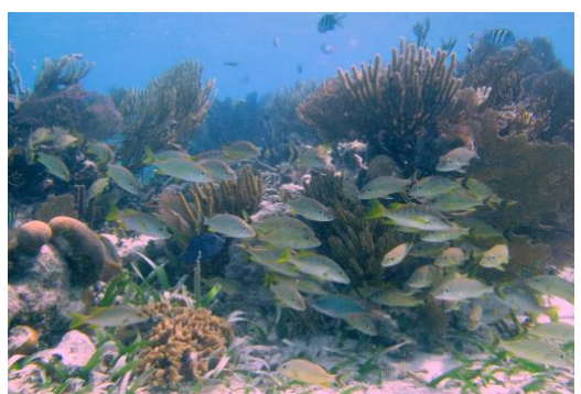
The Belize Barrier Reef

amazing tours and experiences these resources afford for locals and visitors alike. Many noted the small scale, low-density development and population of the area what is described by some as "Barefoot Perfect." Still others highlighted the economic and ecological value of the many protected areas that span the entire southern region.