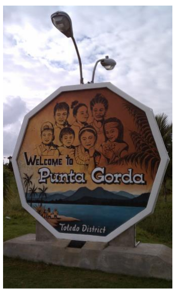
The entrance to Punta Gorda

Due to the occurrence of Hurricane Richard, meetings in Punta Gorda and Dangriga were delayed until late November. Similar to Placencia, the Punta Gorda meeting was well attended and realized participation from approximately 200 members of the community and surrounding villages. The same meeting format was used, wherein government officials provided opening statements on the purpose and rationale of the meeting. and the facilitator followed with a simple visioning exercise to frame the discussion on cruise tourism within the context of local values and perceived assets of the region. The developer briefly described the proposed project and the remainder of the meeting involved open, back and forth discussion between audience members, government officials and the developer.