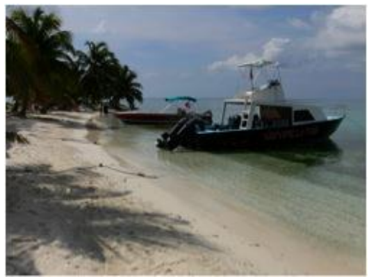
Marine tours at Laughing Bird Caye National Park

Key finding: Among stakeholders who express an interest to learn more and possibly cultivate small scale cruise tourism in the south, there are many conditions required to meet that interest.