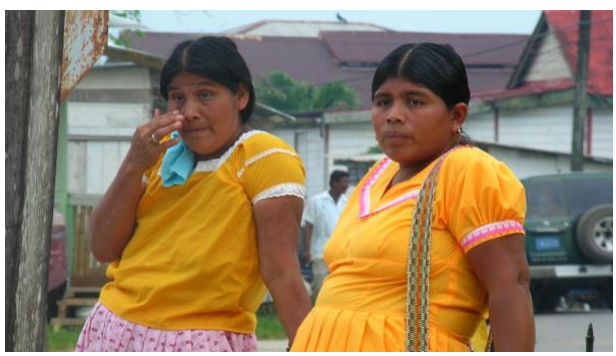
Mayan women of southern Belize

One attendee commented that residents of Punta Gorda Town had previously conducted a feasibility study on cruise tourism which determined—based on small ships visiting the area—that cruise visitors spend very little money once they disembark. She inquired about how these visitors could be kept around longer and convinced to spend more. She went on to question whether the